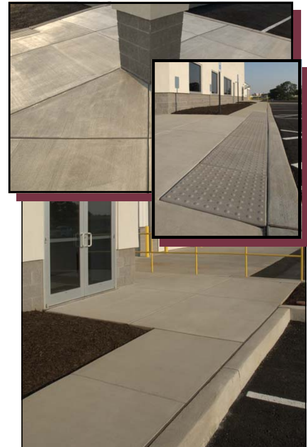
5-Star Trucking Facility Mt. Joy, PA

Want to see the great work we have supplied? Just ask our sales reps. We would be happy to show you our product throughout the south-eastern PA region. Here is a typical example of our work: