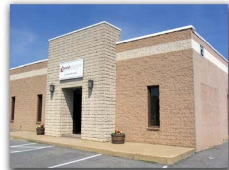
Our New Holland, PA Facility