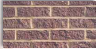
Hershey Red N1062