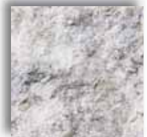
Arctic Ice (Blend) T0008