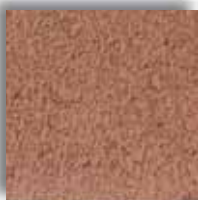
Hershey Red N1062