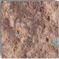
Nantucket Red N1061