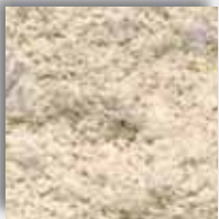
Corn Silk N0580