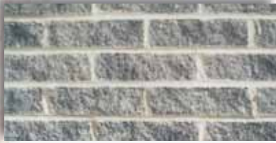
Limestone Ridge (Blend) T0002