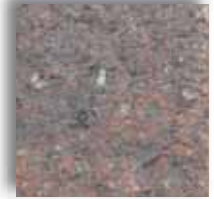
Brandywine Hill (Blend) T0001