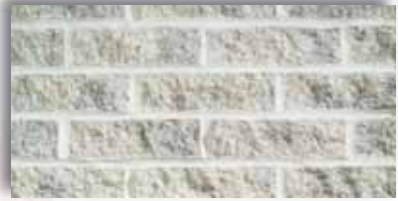
Arctic Ice (Blend) T0008