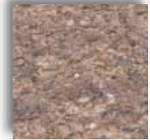
Santa Fe Tan (Blend) T0004