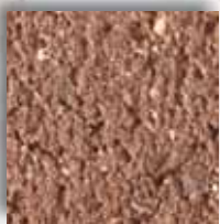
Hershey Red G1062