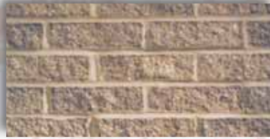
Santa Fe Tan (Blend) T0004