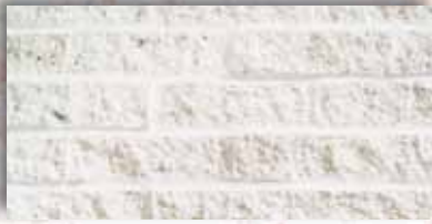
New Holland White N0714