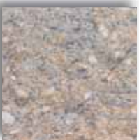
Canyon Blend (Blend) T0007