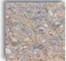
Canyon Blend (Blend) T0007