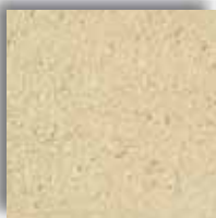
Corn Silk N0580