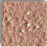
Nantucket Red G1061