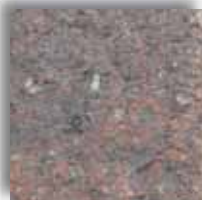
Brandywine Hill (Blend) T0001