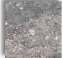
Limestone Ridge (Blend) T0002