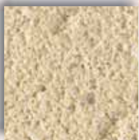
Corn Silk G0580