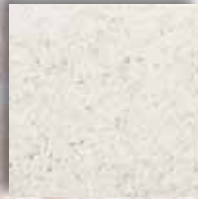
New Holland White N0714