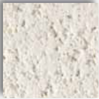
New Holland White G0757